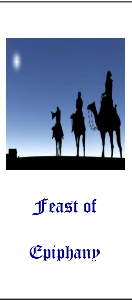
Feast of Epiphany

BIBLE STUDY FOR ADULTS: the bible study titled “Matthew, the King and his Kingdom” will resume Monday, January 22 at 6:30 PM in the parish hall.